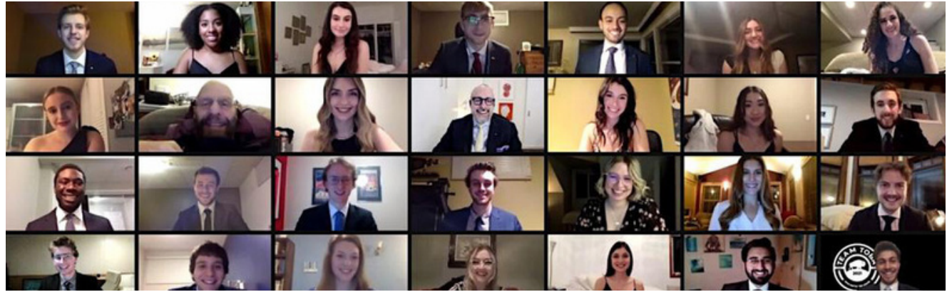
* Team Toba 2021 during Virtual Gala night at JDC West 2021